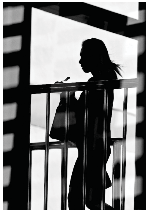
Reflection of a reflection of a lady in Bangkok Kent Van Vuren