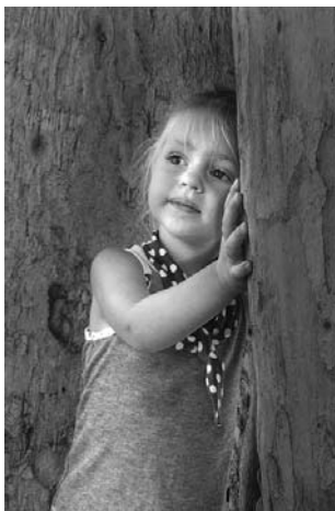
01-A Future Model.jpg