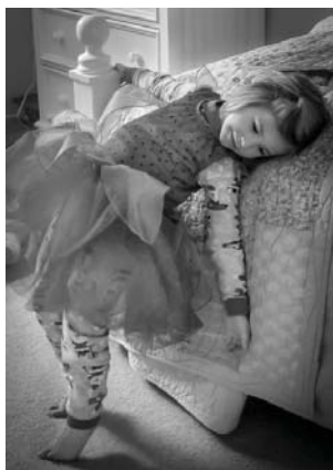
03-Always the ballerina.jpg